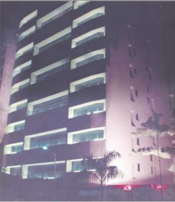
VASWANI GARDENS, CUFFE PARADE