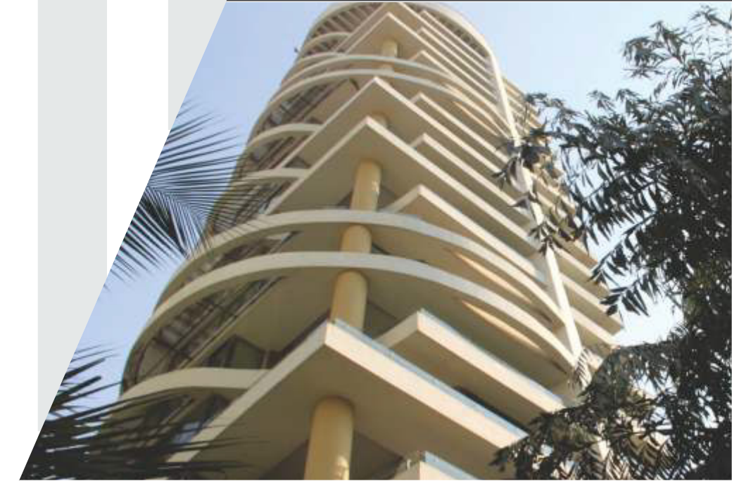
THE SAVOY, NEPEAN SEA ROAD