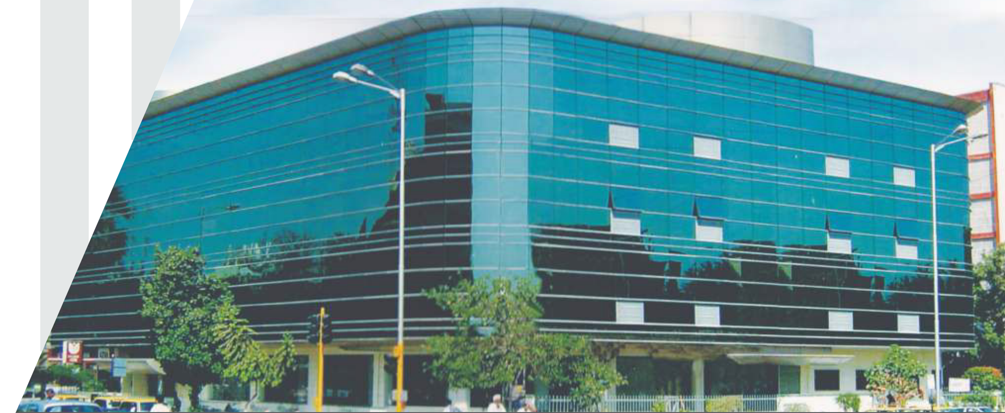
VASWANI CHAMBERS, WORLI