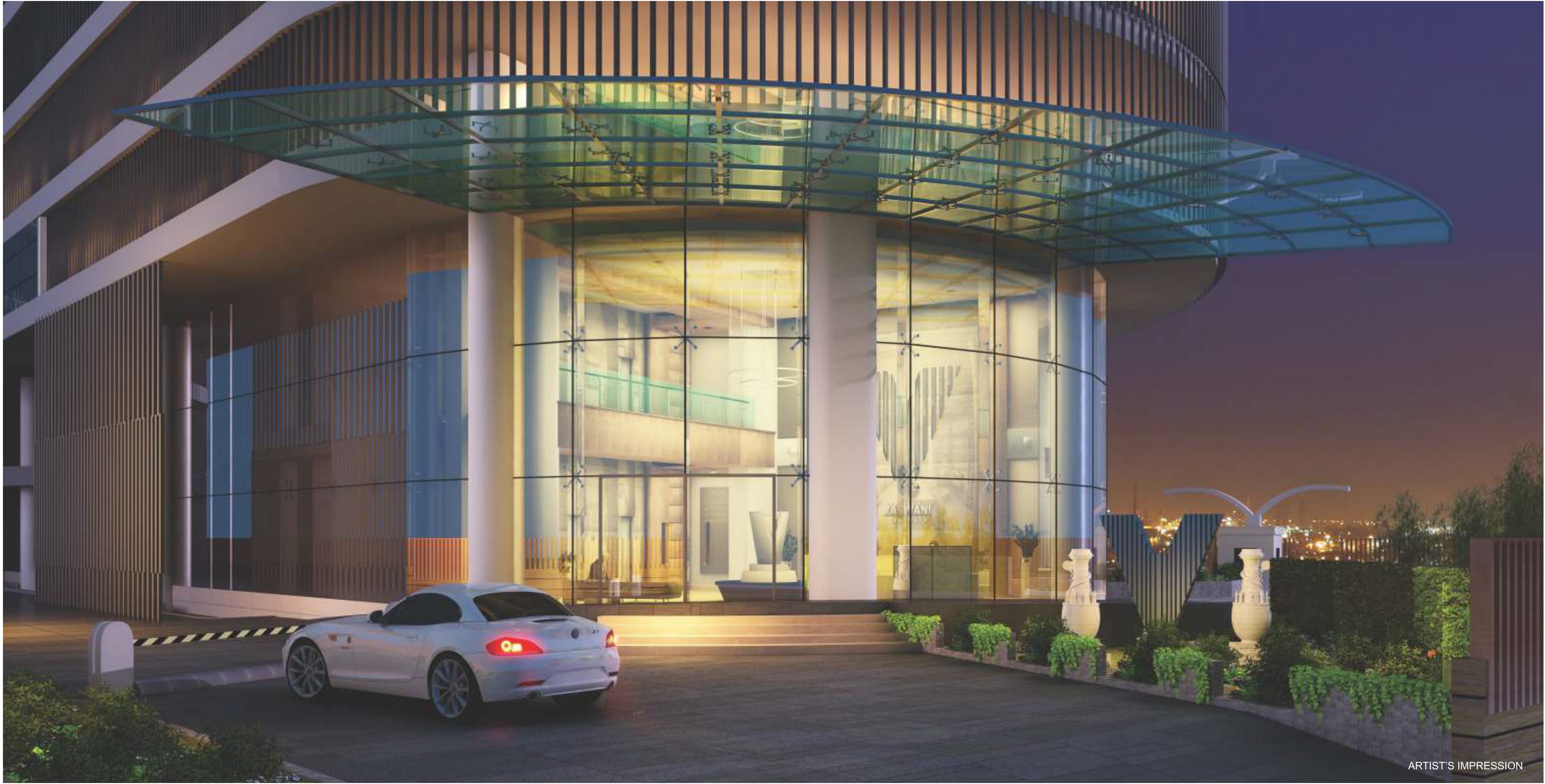
ARRIVE IN STYLE