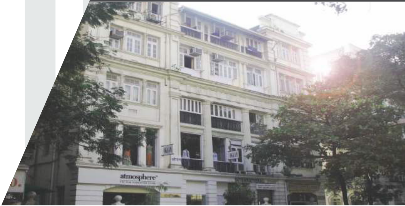
VASWANI HOUSE, COLABA